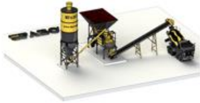
Plate 1A: A Continuous Mixer