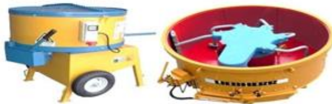
Plate 1E: A Pan mixer