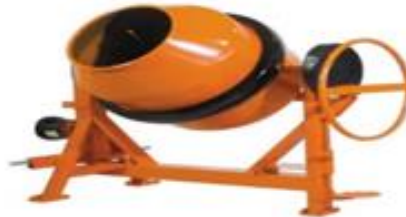
Plate 1D: A reversing drum mixer