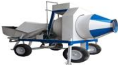
Plate 1C: A non-tilting drum mixer