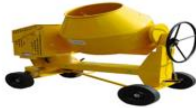
Plate 1B: A tilting drum mixer