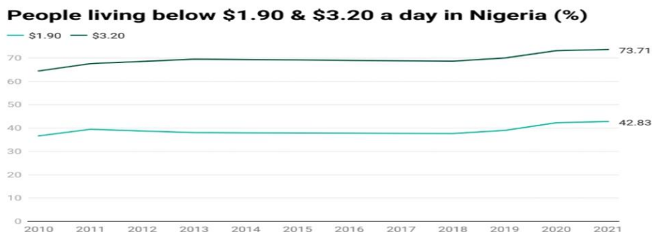
Figure 1. People living below $1.90 and $3.20 a day in Nigeria from 2010 to 2021 in percentage (Source: Sustainable Development Report).

There are two poverty lines that are used to classify where people stand financially in Nigeria. The upper poverty line is N395.41 per person annually which is two-thirds of the mean value of consumption while the lower poverty line is N197.71 per person annually which is one-third of the mean value of consumption. So, if you fall under the lower poverty line, then you are extremely poor while if you fall under the upper poverty line, you are moderately poor.